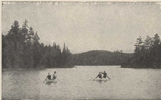
On the Montreal River, Temagami.

Black bass, speckled trout, lake trout, wall-eyed pike in abundance. Moose, deer, bear, partridges and other game during hunting season.