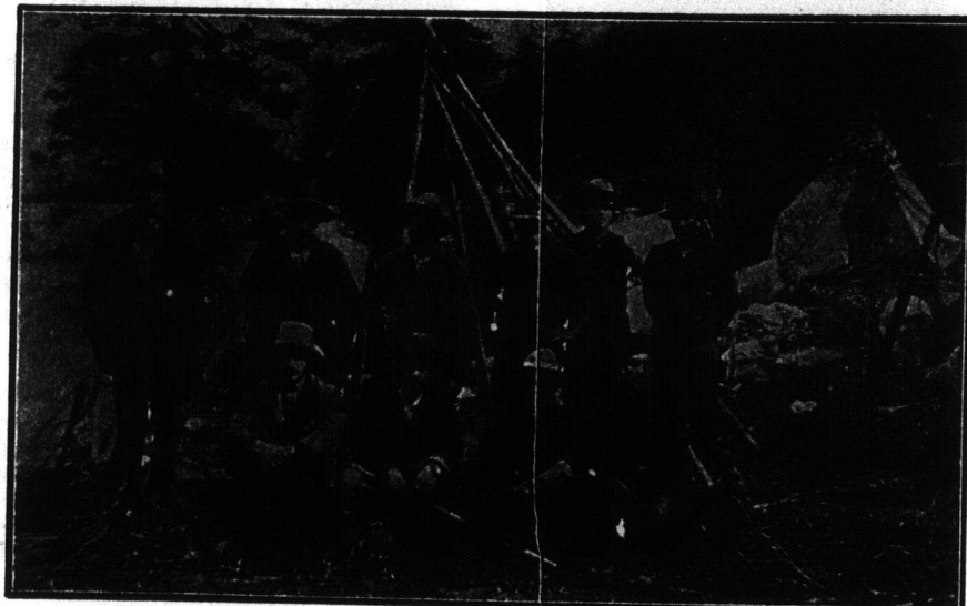
[Photo "Canadian Alpine Club Journal, 1910." —Alpine Club Party, Camp at Foot of Robson Glacier.

Sir,—I am much interested in your paper, especially in the correspondence, which seems excellent for making people acquainted. I wonder if any of your kind correspondents could inform me how to obtain a situation on a farm, where I could continue dairy and poultry farming, which I like very much, and enjoy the work, milking and butter making. I can also cook. I came from England with a friend to stay with friends, who subscribe to the W.H.M. I like Canada very much, and think that if I can get experience in dairy farming, should like to make my home here. I should prefer somewhere in the