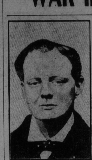
WINSTON CHURCHILL Who dares the Suffragettes to "Come On."