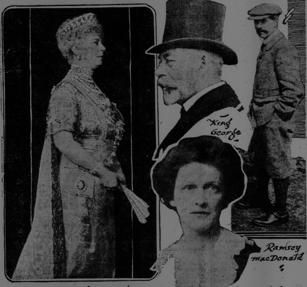
Queen Mary in court dress -