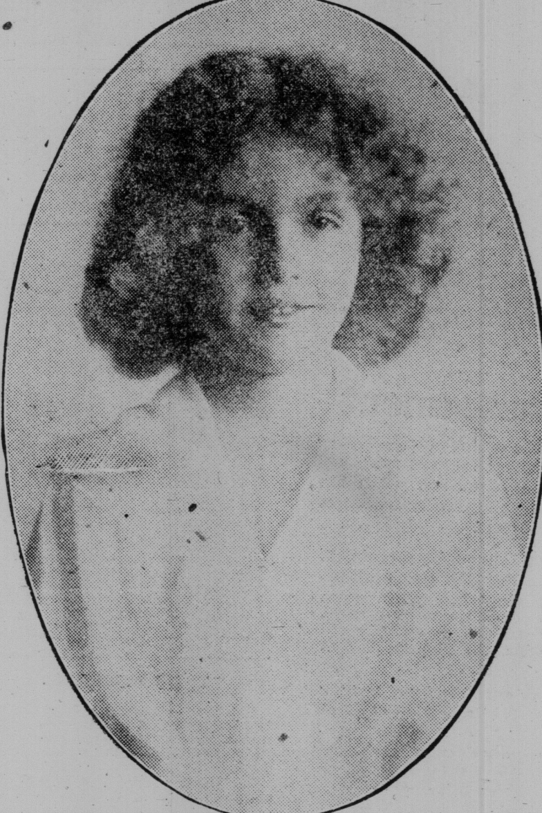
Otto, crown prince of the old Empire of Hungary, aged 8, around whom a widespread propaganda has been started to make him king of Hungary.