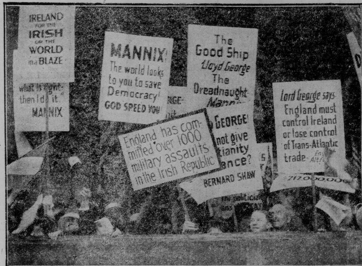
Scene at the wharf in New York when Archbishop Mannix sailed for Liverpool.

HILL IN Hill and B solid betch, seven Will engage Additional ROBB Koss Building. PROBS: Moder w