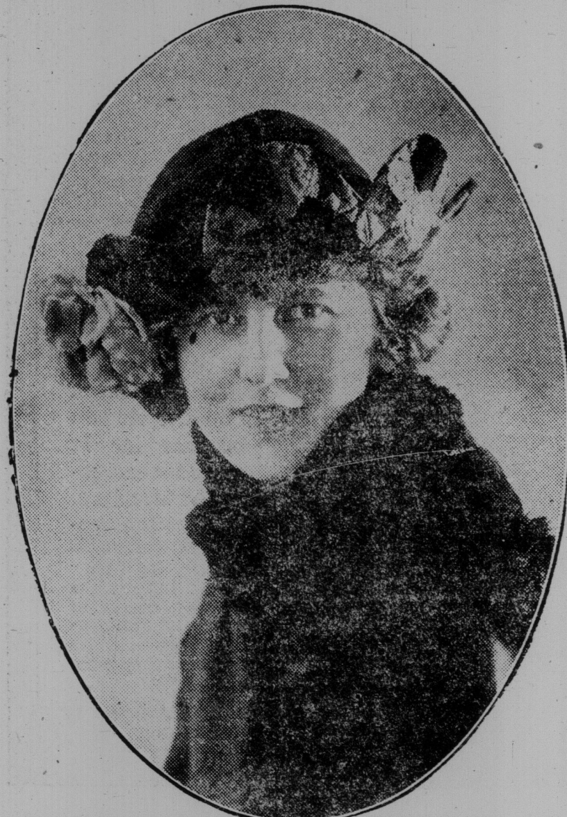
Closely fitting turban for motoring, showing unique application of velvet leaves in tones of green on upturned, petal edge brim.