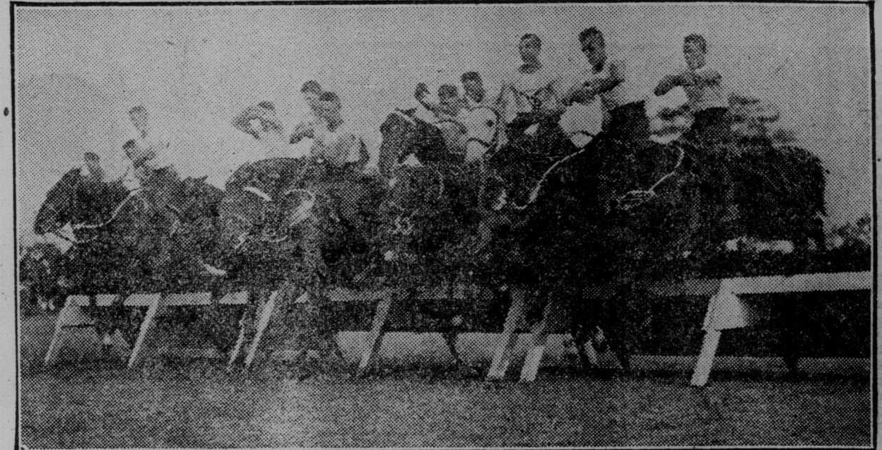
At the Cobourg Horse Show. Royal Military College cadets from Kingston going over the jumps with their arms folded.