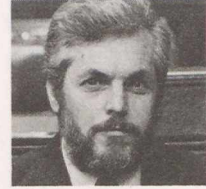
Mr. Jim Manly, N.D.P. Cowichan—Malahat— The Islands (B.C.)