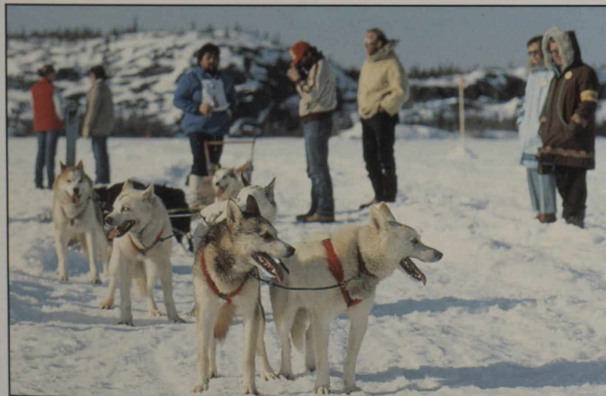
Dog-sledding, Northwest Territories.