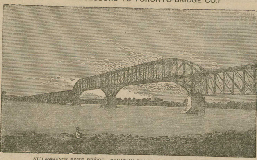
ST. LAWRENCE RIVER BRIDGE, CANADIAN PACIFIC RAILWAY, LACHINE, P. Q.