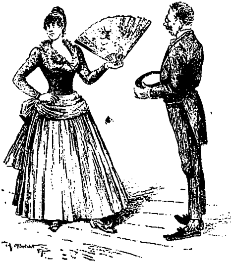
"MISERY LOVES COMPANY."

"NO, Mr. Malaprop, I have determined to live and die single." "So have I, (happy thought.) Suppose we get married and carry out our resolve together."