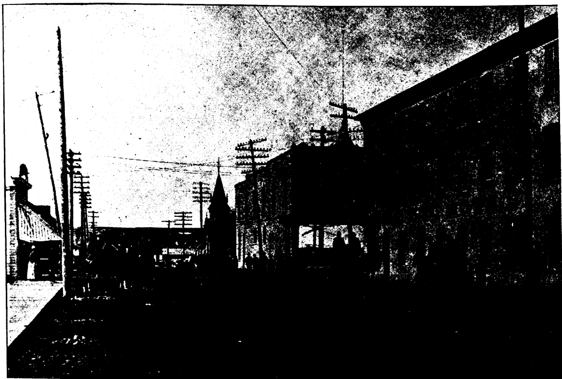
McTAVISH STREET, LOOKING NORTH.