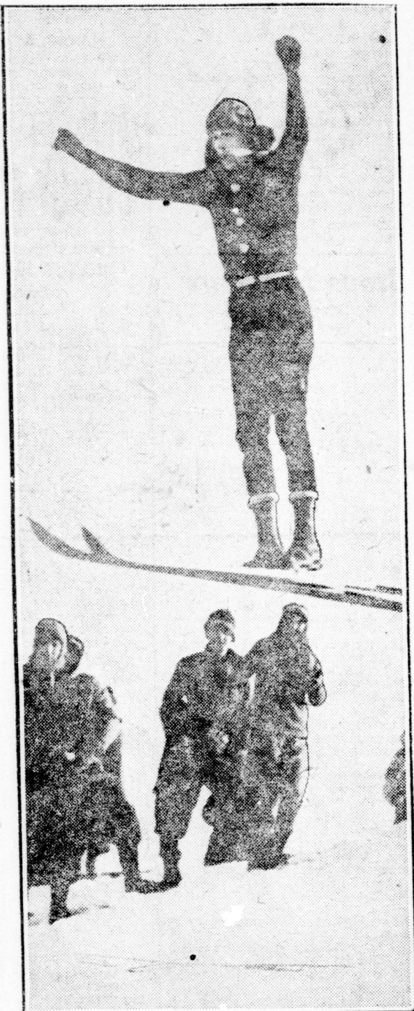
This is ski-jumping time. Already the long gliders have made their appearance on the Canadian slopes, whether natural or artificial.