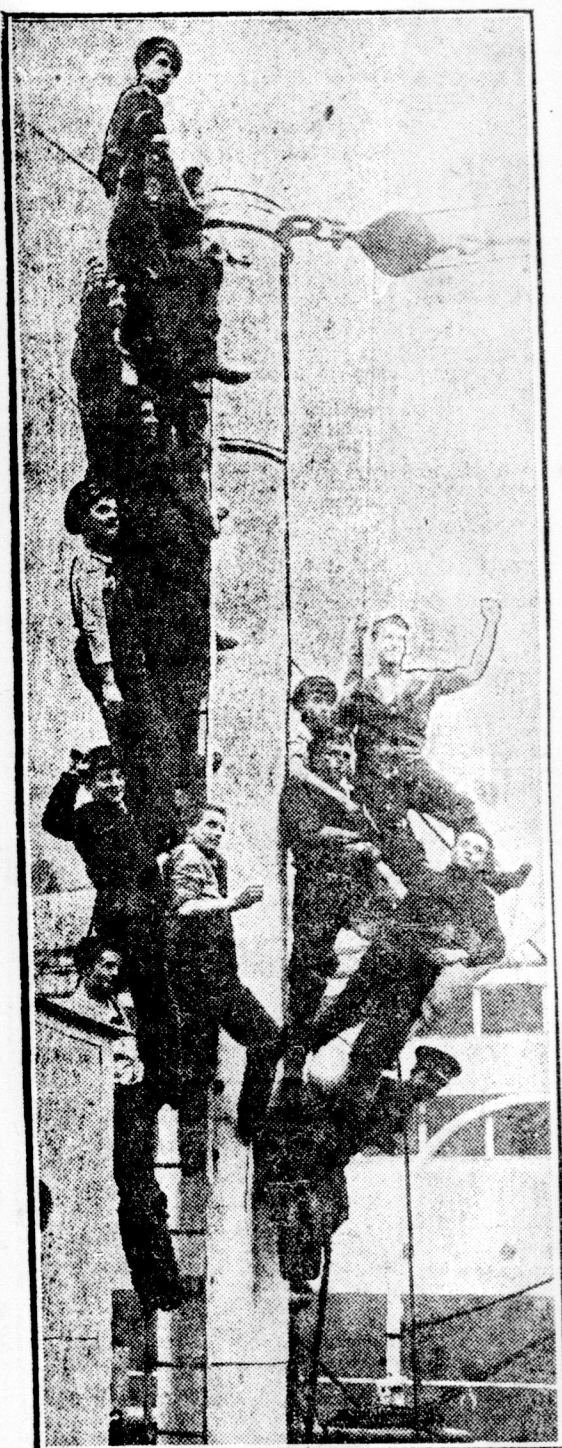
When the S.S. Manalia docked in New York recently, it was learned that she had on board twenty-four cadets from the British Isles. They are working and studying on the ship with the idea that they may own vessels of their own some day.