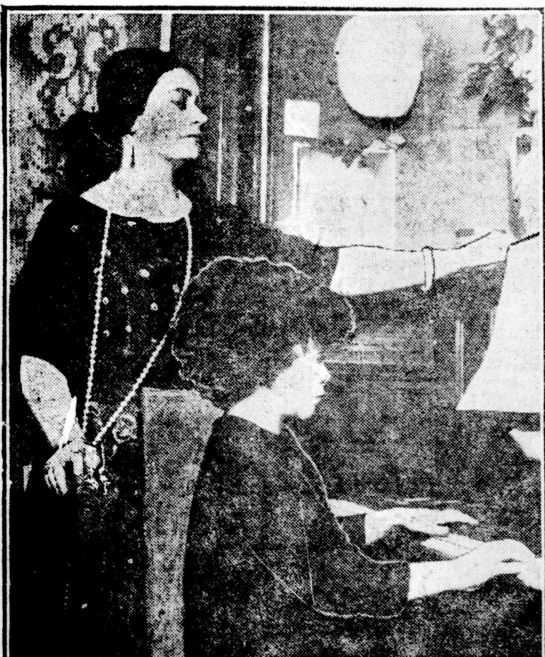
This little five-year-old Russian prodigy, a little Mozart, already plays Chopin and Mozart as well as his own compositions. After a series of concerts in Vienna, he is to sail for this continent, with his mother, for engagements here.