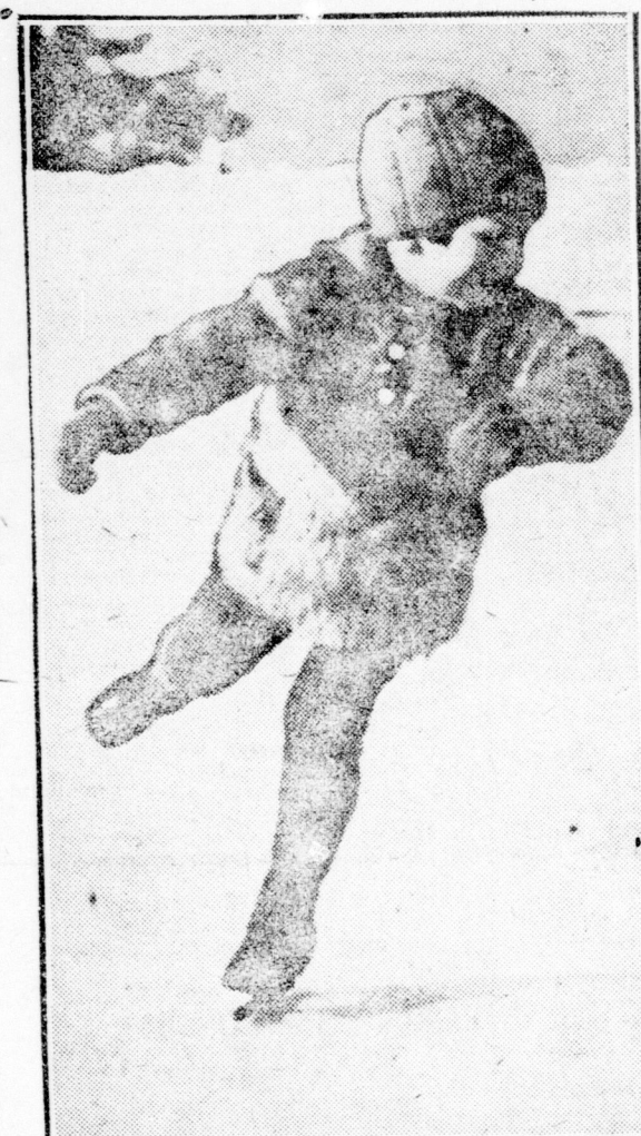
Her skates are the envy of others several times her age. With the cold weather and ice on the ponds and open spaces, Canadian youth is given an opportunity to try out the skates Santa left.