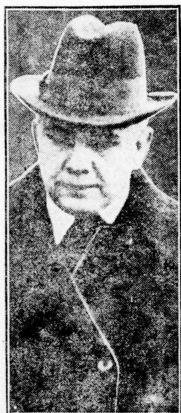
Without the consent or knowledge of his mother, Harry Kendall Thaw has been conferring with lawyers in an effort to obtain his release from the Philadelphia Insane Asylum, on the ground that he is a sane man.