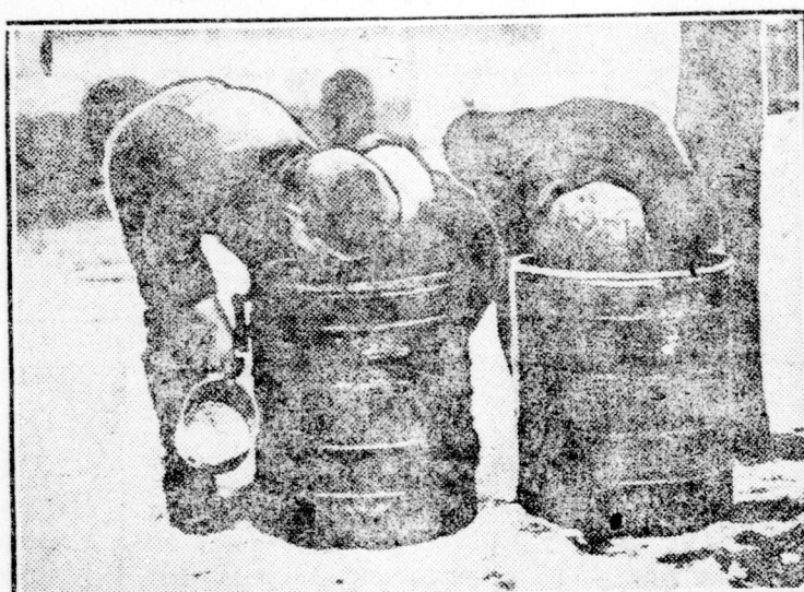
Still hungry! These three German boys have just received their rations from the kitchens of a relief organization—but still, by scraping the soup kettles carefully, they have hopes of finding something left.