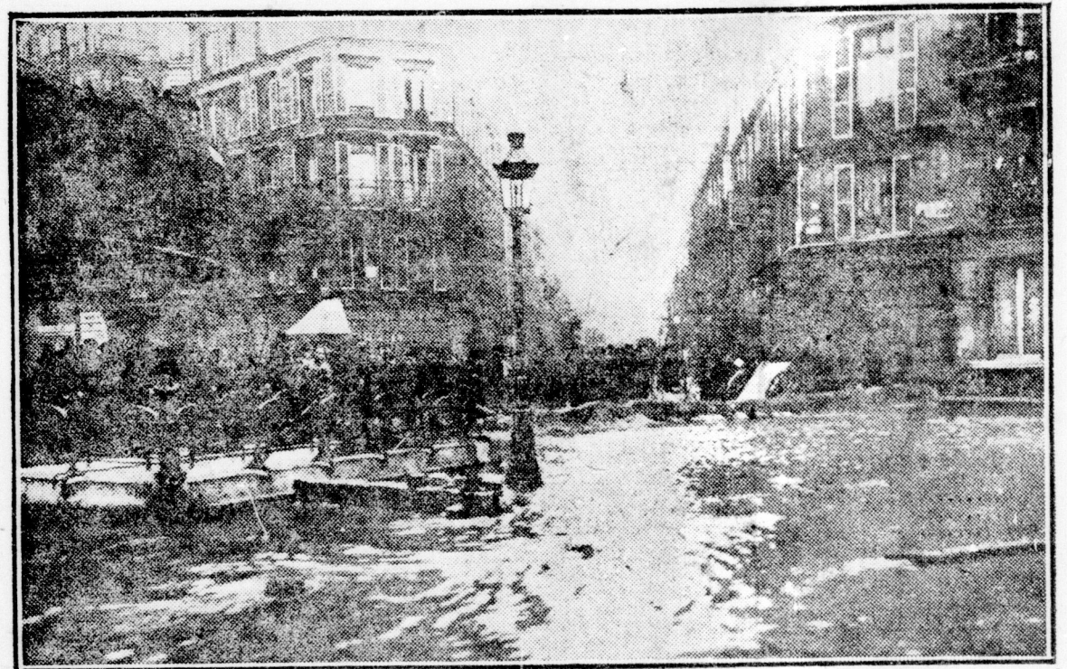
Again history repeats itself. The Paris suburbs are once more filled with the angry waters of the Seine. It is believed that the floods will rise above the high mark of 1920. The damage is estimated in millions of francs.