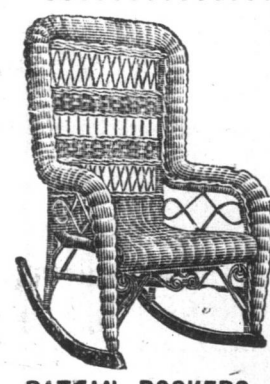
$3.50 TO $6.00

READ YOUR SAVINGS ON PARLOR FURNITURE BELOW.