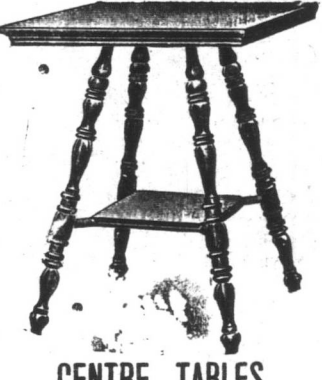
$1.00 TO $7.25