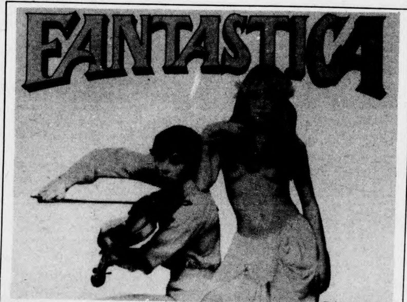
Alternative cinema, such as Fantastica could arrive at York series

In the meantime, Bethune Council and the CYSF might be commended for attempting to take a definite, if initial, step towards a rational, mutual program. Final credits go to the film department for establishing a welcome exhibit of its own talent.