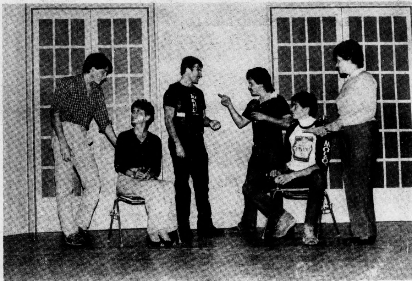
Rehearsal scene in "An Inspector Calls," a drama centering on the innermost problems of a family.

At home, he discusses the situation with his wife, who is the real bread winner of the family. She seems to think he has nothing to lose, so he signs a contract with the mysterious music agent. Immediately, his life is transformed from that of a down-and-out musician into that of a national superstar. In the process, he loses touch with