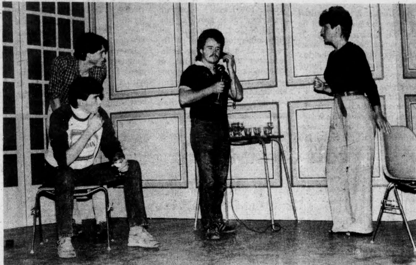
Rehearsal scene in "An Inspector Calls," a drama centering on the innermost problems of a family.

"An Inspector Calls" will be on at 8 p.m. from December 4 to 8 at Memorial Hall. Tickets are $4 for adults, $3 for students/senior citizens and are available at Mazzuca's or from Theatre Fredericton members.