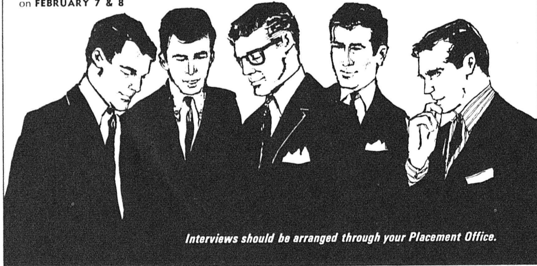
Interviews should be arranged through your Placement Office.

The Beaver Representative will visit your campus on FEBRUARY 7 & 8