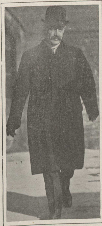
RT. HON. ROBERT LAIRD BORDEN, P.C.