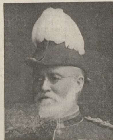
SIR JOHN GIBSON, K.C.M.G. Hamilton

is happy and contagious, for he is human. Sir John is a native of Hamilton. He has practised law there; commanded the 13th Regiment of Hamilton; and sat for Hamilton in the Legislature until the Ross Government, in which he was a Cabinet Minister, went out in 1905. His honour is Hamilton's honour. On New Year's Day Sir John was seventy years old; the elite of Toronto rolled in carriages to Government House to congratulate the popular Governor on his birthday and Knighthood.