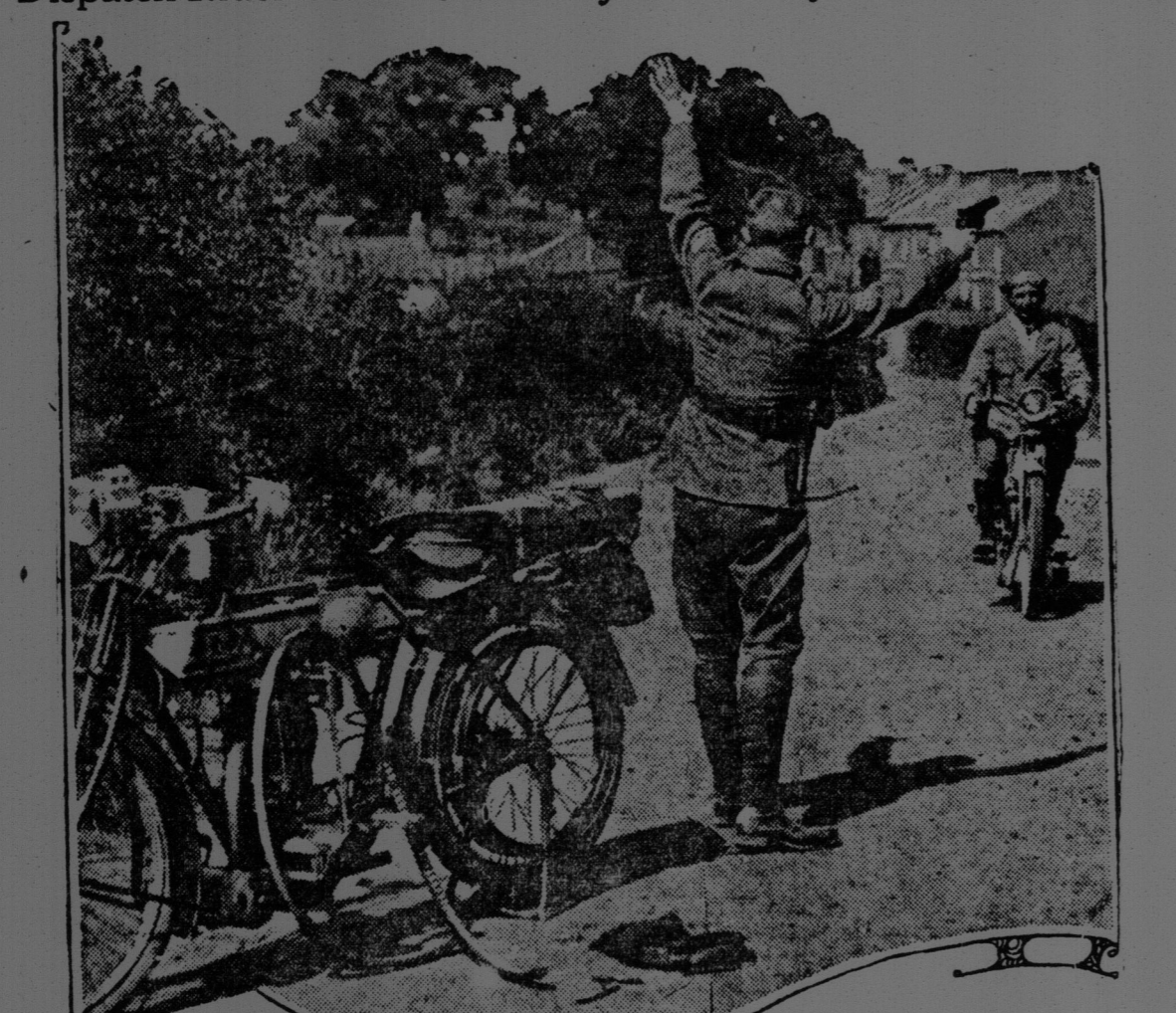
British dispatch rider, whose machine has broken down, holds up a civilian motor-cyclist with his revolver and commandeers his motor. Then he completes his journey with his general's message.