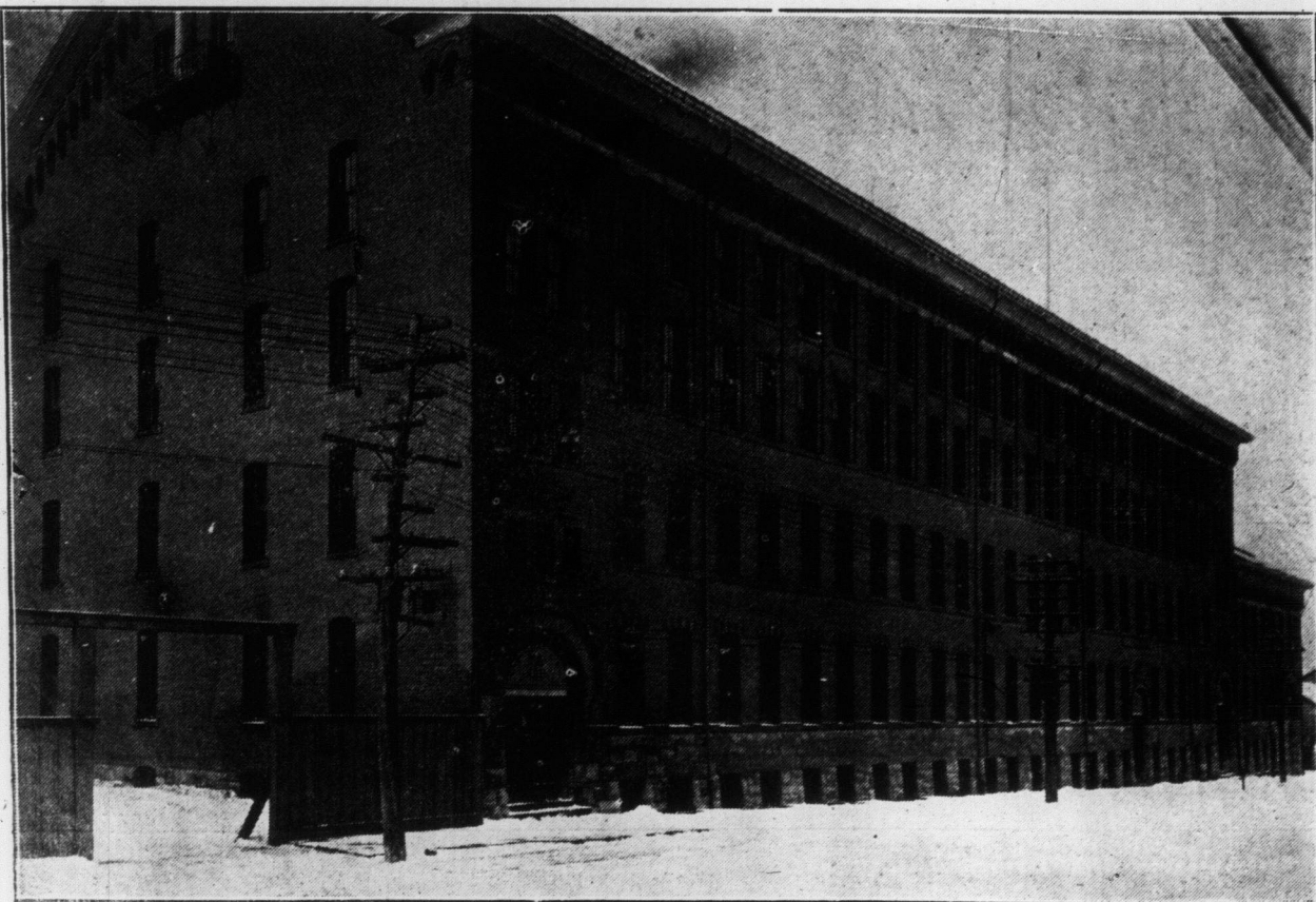
THE HOME OF TUCKETT'S, HAMILTON.

NEXT WEEK—FIRST TIME HERE OF THE SOCIETY DRAMA "THE PENALTY" SPLENDID CAST BIG PRODUCTION—NEXT WEEK