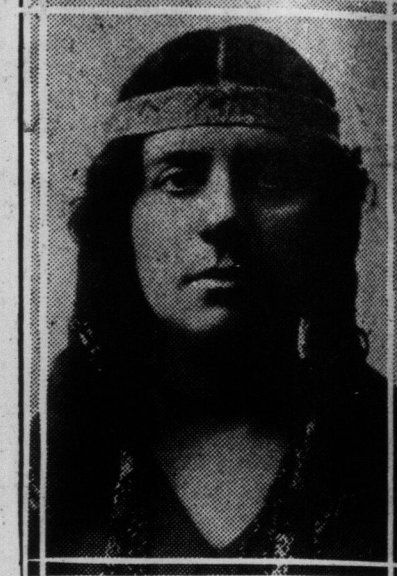
MISS BUCKINGHAM as "WANGA"

A BEAUTIFUL ROMANCE OF ADVENTURE BETTER THAN "THE ROUND-UP," AS FASCINATING AS "THE SQUAW MAN."—ANOTHER "ARIZONA"