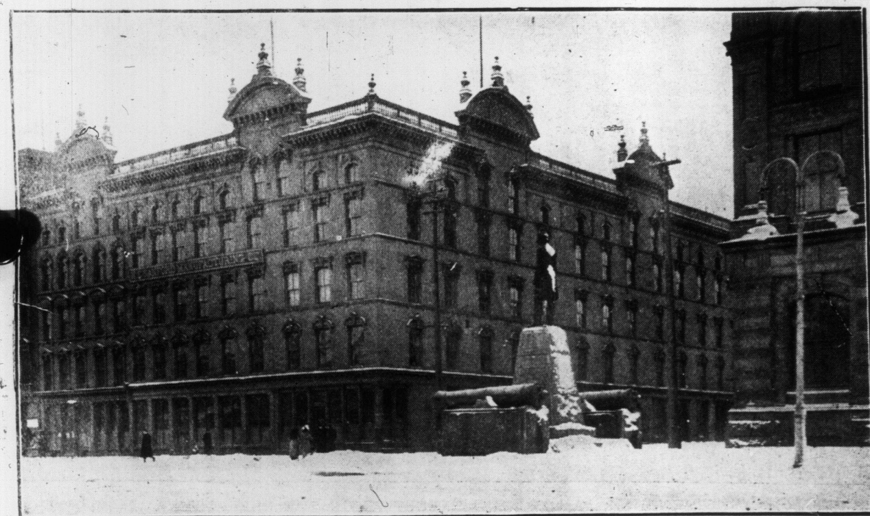
W. E. SANDFORD MANUFACTURING CO. ONE OF HAMILTON'S OLDEST AND BEST KNOWN INDUSTRIES.