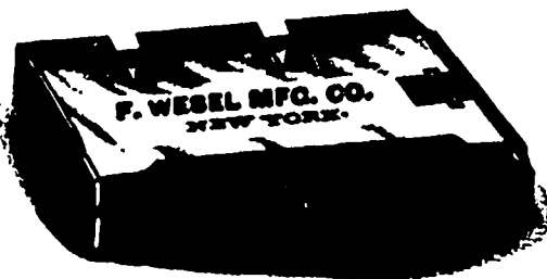
Improved Plain Old Style Block, with Patent End Hook.