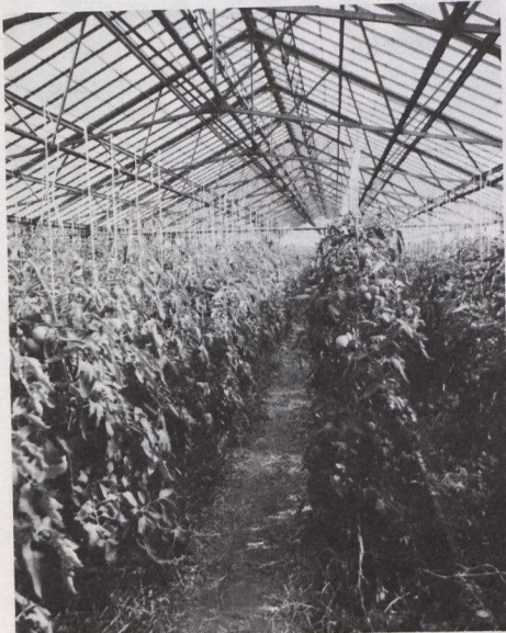
Tomatoes and cucumbers are the crops most likely to be grown in waste-heated greenhouses.

Waste heat from thermal or nuclear power plants, oil refineries, chemical plants and natural gas pipeline compressor stations may become important heat sources for greenhouses, says Agriculture Canada.