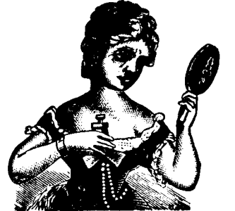
A skin of beauty is a joy forever.

KIDNEY PAINS, Backache and Weakness cured by CUTICURA ANTI-PAIN PASTER, an instantaneous pain-subduing plaster 30c.