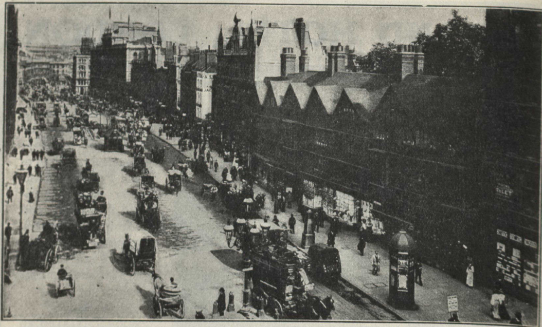
Holborn, one of the main thoroughfares of London, being a continuation of Oxford street to the city. The famous old houses in front of Staple Inn, now preserved in their original shape, are seen to the right of this view, looking eastwards.