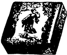
F. &amp; E. W. Kelk

ever, a good supply of all goods suitable for Christmas, and, in order to clear out, are making suitable discounts on nearly all lines. The illustrations of a few of this firm's goods show some exceedingly dainty designs in toilet sets which they are offering.