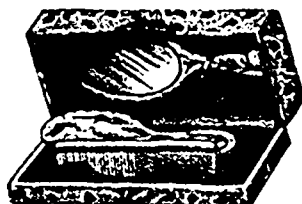
F. &amp; E. W. Kelk

F. & E. W. Kelk have done an excellent Christmas trade this year. They carried an excellent range of dolls, toys,