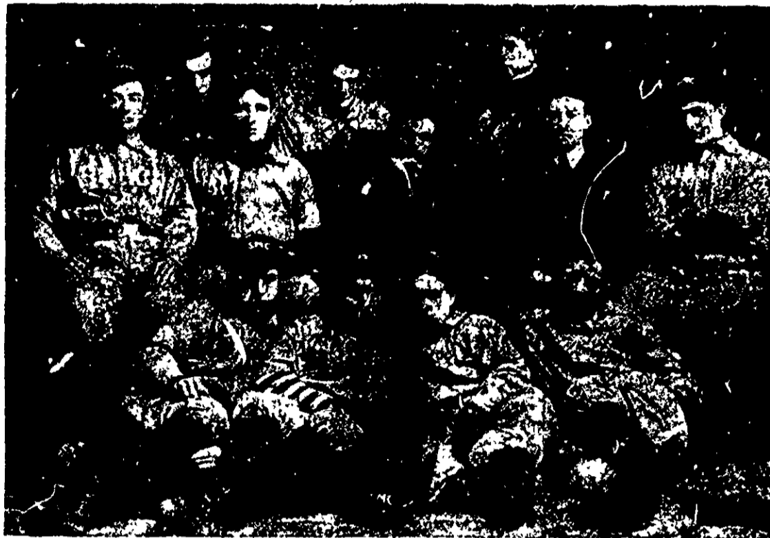
ST MICHAEL'S COLLEGE BASEBALL TEAM '01-'02