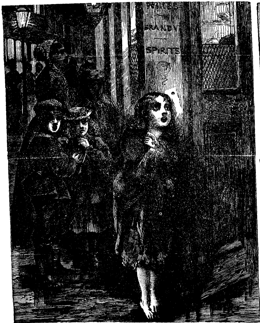
THE SALOON KEEPER'S SIGN.