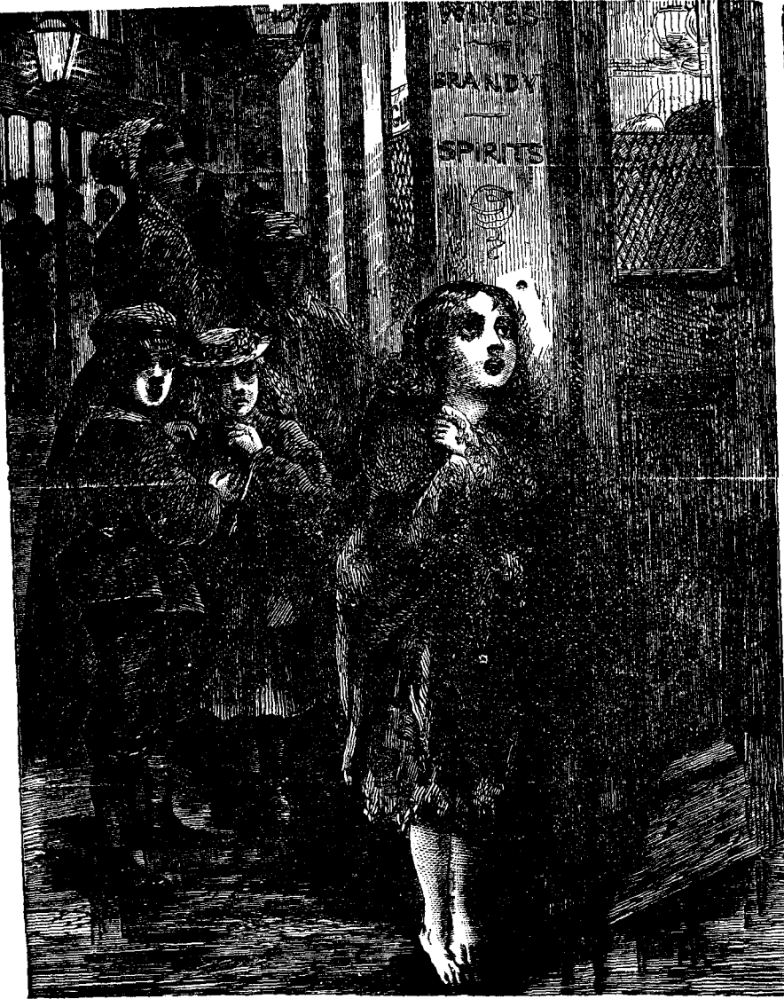
THE SALOON KEEPER'S SIGN.