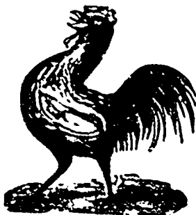
"I CROW OVER ALL."