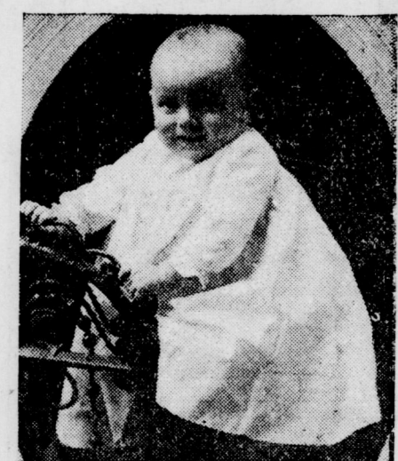
THE RISING GENERATION. Pretty Little Toddler, the Son of a Well-known Hotelman.

A motion was unanimously passed to the effect that women should receive political and ecclesiastical franchise.