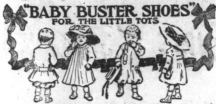
LET THE LITTLE FOLKS WEAR "BUSTER BROWN" SHOES, TOO

SOMETHING ALTOGETHER NEW. IF ITS MADE WE HAVE IT!