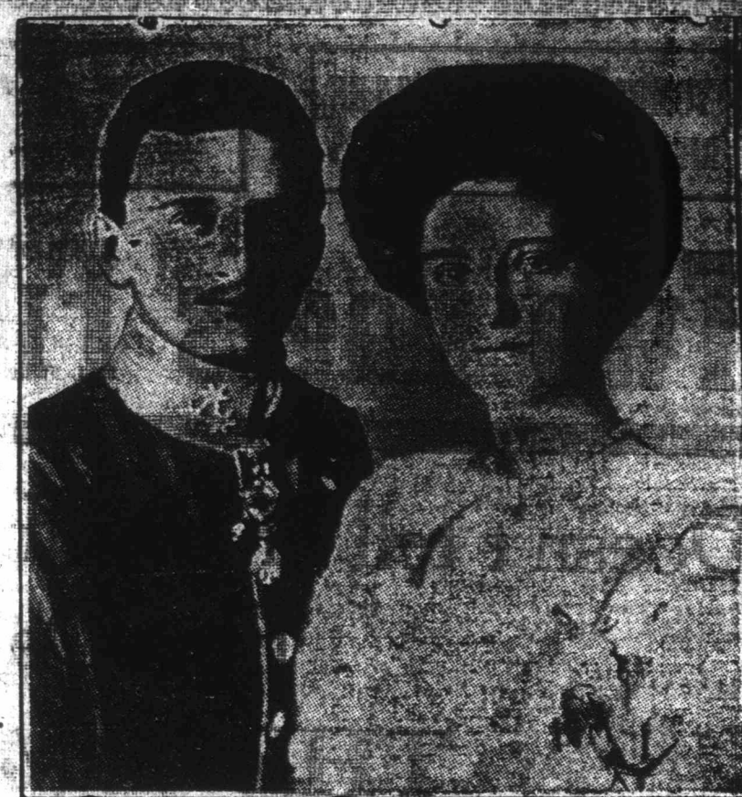
NEW HEIR TO AUSTRIAN THRONE

Five Sunday Schools were represented: Intermediate of St. Paul's, Victoria Avenue Methodist, Knox Presbyterian, Assiniboine Avenue Methodist, and the Congregational Church. The whole day's proceedings passed off well.