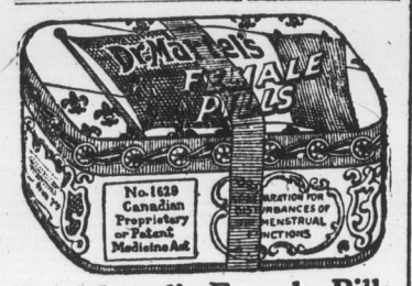
Dr. Martel's Female Pills Prescribed and recommended by Physicians, cold for half a century in Patented Tin Box with sidnature "Knickerbocker Remedy Co."

4. Doth flee unto one of those ci-4. Doth field units offe of those of the offective of the offective of the offective of the offective of the reach one of the cities of refuge, it was provided that the roads should be at least thirty-two cubits, or about fifty feet, wide, kept in good repair with all obstructives characterized with the roads offective offective offectives. tions removed, all streams bridged and signa at every turning showing the way to the city of refuge. Every advantage was thus given to the slayer to escape the avenger of blo Bhall declare his cause—When slayer arrived at the gate of the of refuge, he was allowed to state of blood the hi case to the elders of the city and they received him, assigning to him a suit-able place of residence, provided they convinced that his act in taking were convinced that his act in taking the life of another was unitentian or accidental. 5. If the avenger of blood pursue after him—It was, ex-pected that the avenger of blood would be in close pursuit of the slay-er. Shall not deliver the slayer up into his hand—The elders of the city refuge had undertaken to protect of retuge had undertaken to protect the man who had fled thither for saf-ety, and they would not give him over them because they were convince that he had done no intentional