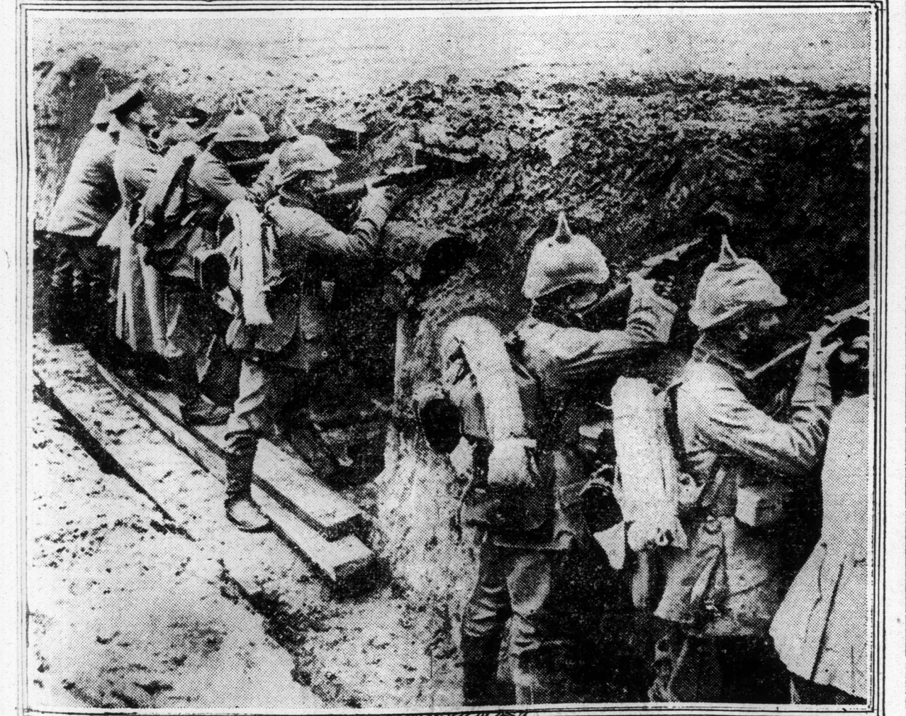
An advanced German trench in Northern France, showing Germans standing at their loopholes anticipating a French attack. They are all carrying their kits so as to leave nothing behind in case they are ordered to retreat in haste.