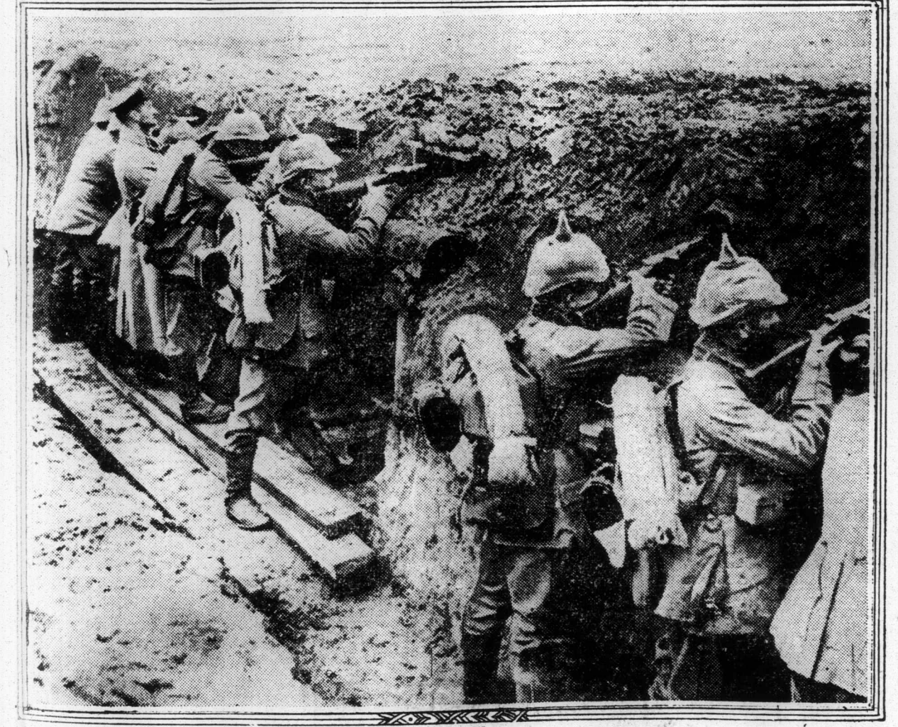
An advanced German trench in Northern France, showing Germans standing at their loopholes anticipating a each attack. They are all carrying their kits so as to leave nothing behind in case they are ordered to retreat in