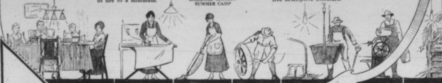
CONVENIENCE AT MEALS. EASY IRONING. RUNNING WATER. RUNS VACUUM CLEANER. LIGHT IN GARAGE. MAKES CHORES EASY. RUNS SEPARATOR. LIGHTS BARN

Just write your name and address on the coupon provided and mail to our house nearest you for free descriptive literature.