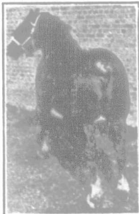
Bismarck de Vladisloo 49422

B STEELE, BRIGGS, SEED CO., Ltd., Winnipeg, Man.