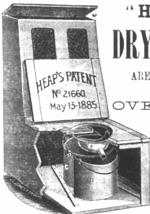
BEDROOM COMMODE—A, the Urine Separator; B, Urine Receptacle; C, Excrement Pail.

Children, such a Guide and Friend is offered to you in the Lord Jesus Christ. Won't you accept Him now?