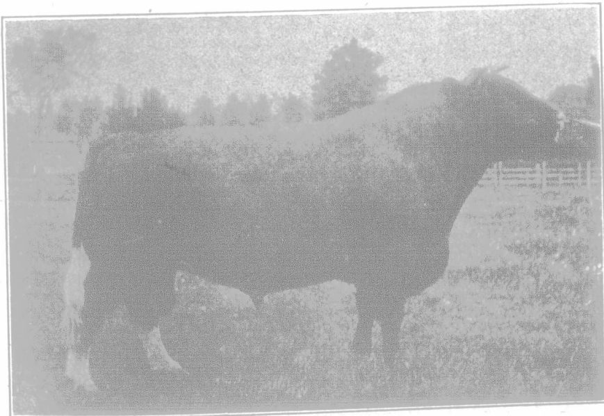
RED ROBIN No. 100810—Weight at 5 years of age 2,600 lbs. Sire, Robin (imp.). Dam, Octavia. His sire imported by Macdonald College, was without doubt the greatest dual-purpose sire ever exported from England. Octavia was a 65-lb. per day cow weighing 1,650 lbs.

The average milk production of the above nine cows is 10,207 lbs., averaging over 4% fat, five of these records being two-year-olds. The average weight of the above cows and heifers is 1,492 lbs.