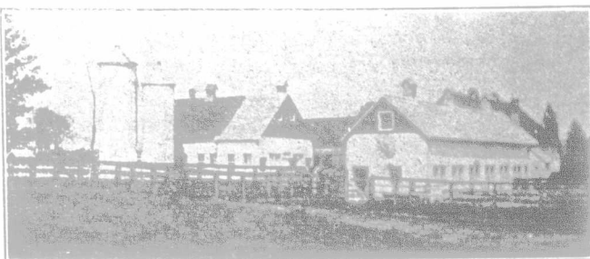
"AT HOME" TO ALL