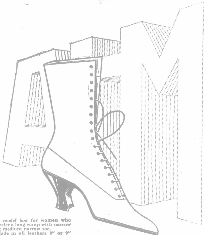
A model last for women who prefer a long vamp with narrow or medium narrow toe. Made in all leathers 8" or 9" height, Louis or Spanish heels.

swer to a similar y an authority on ovember 21, 1918. eams or watering- affect the bees. As- re receiving proper olonies are strong there can be only event the harvest- is that the bloom nt, and the second e conditions in the present. There nces where fields were not yielding