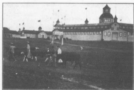
Some of the buildings at the Sherbrooke Fair