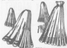
5334 Seven Gored Skirt, 22 to 32 waist.

The dainty blouse made in lingerie style has really become an essential, and every new model is sure to be met with a hearty welcome. Here is an exceedingly attractive one that is simple withal and that can with equal success be made from lingerie materials from the very thin and soft silks and such dainty wool fabrics as chiffon veiling and the like.