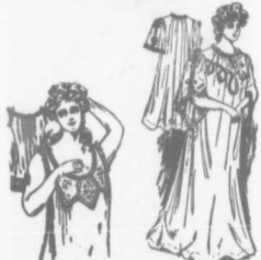
5355 Fancy Chemise, Small, Medium, Large.

The waist is made with lining, which can be used or omitted as material renders desirable, and itself consists of the front and the backs. These