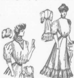
5324 Misses' Tucked Blouse or Slip, 14 and 16 years.

Princess skirts are not alone fashionable, they also are very generally becoming, very graceful and alto-