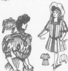
5348 Fancy Yoke Blouse, 32 to 40 bust.

Each fresh variation of the shirt waist finds its welcome and its place. Here is one that combines box plaits with tucks after a most satisfactory and becoming manner and which is adapted to all the lighter weight shirt-ings.