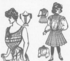
5355 Corset Cover, 32 to 42 bust.

Skirts that are circular in effect whether or not they are so in fact make the favorites of the season and are so eminently graceful and attractive that there is ample cause to re-