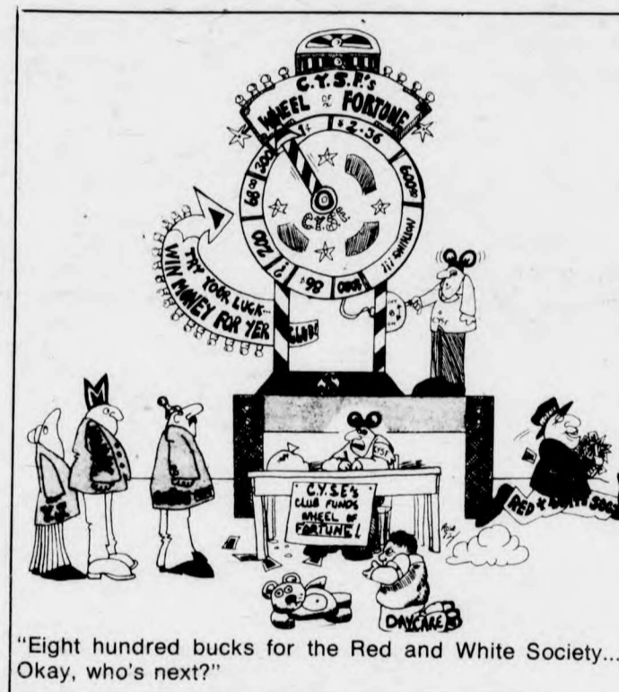
"Eight hundred bucks for the Red and White Society... Okay, who's next?"