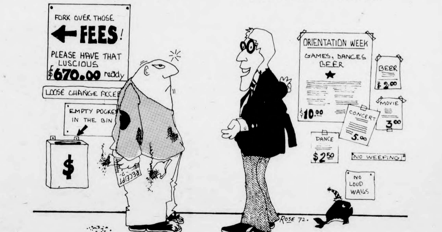
"And now, for a few more dollars, you can have a whole week's fun at Orientation!"

Over the past years, Excalibur has used CYSF sparingly for its cartoon topics, since the august body has either proved too easy a target, and therefore boring, or a dry source of inspiration, and therefore boring again.