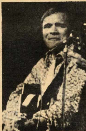
Minstrels Swing !

So much for the review... it was the best show to hit Dal in a long time.