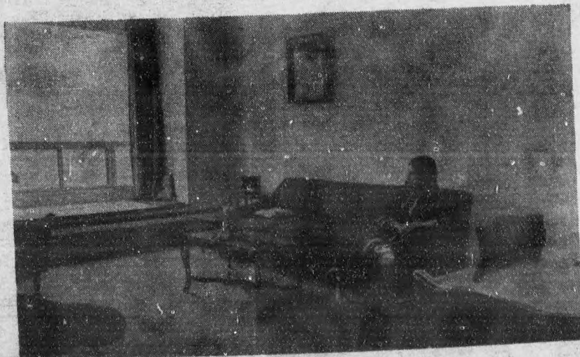
Living Room 780 Montgomery Street

drop in or write the N.B. Residence Co - op Ltd., suite 102, 780 Montgomery Street or call 454-3764 or 454-9696