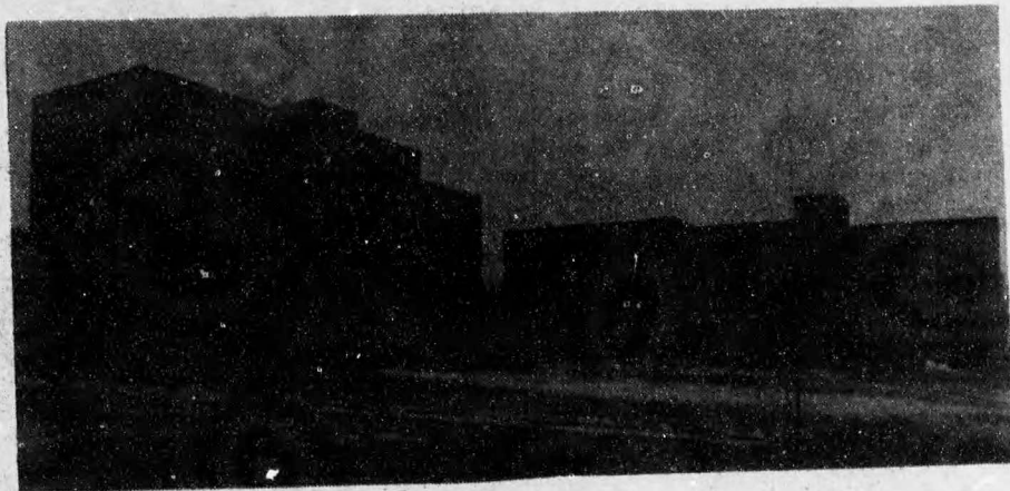
Montgomery Street Project

Room and board supplied for $ 57 - $ 70 per month or $ 14 - $ 18 per week. Room only: $ 7 per week