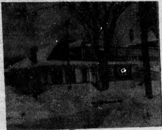
555 Aberdeen St.

Then consider staying at the facilities of the N.B. Residence Co - op Ltd., a non - profit, campus housing organization