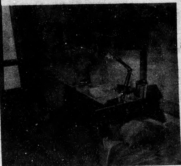
Bedroom 810 Montgomery St.

Completely furnished 2 and 6 man units with many single rooms, kitchen and washroom facilities. TV room, laundry room and food store located on the project. Rents $ 50 - $ 60 per month or $ 12 - $ 15 per week. Heat, light, water and linen supplied