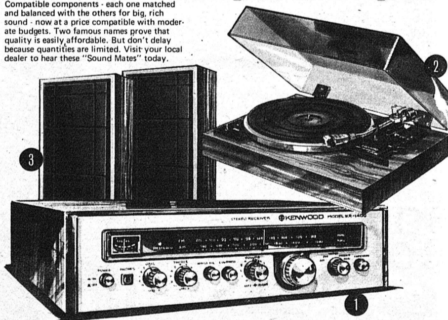
1 KENWOOD KR-1400 AM/FM STEREO RECEIVER

Direct Coupling Pure Complementary Circuit in Power Amplifier • First Stage Differential Drive & Ultra low Noise, Low Distortion DLOAs in Pre-amplifier • Low Distortion Gain-Type NF Tone Control • 5-Gang Volume Control for Low Noise Reproduction • Independent Tape Monitor & Tape Dubbing Switch with Through Circuit • Tone Control with Turnover Selector, Bass-200/400Hz, Treble-3/6kHz 2-dB Attenuator • Phono Input Impedance 50/30KΩ Selectable • 7/12kHz Hi-Filter & 20Hz Subsonic Filter • 2-sets of Tape Deck & 3-pairs of Speaker System connectable 300W (HF), 70W x 2 (RMS Both ch. driven 8Ω 20-20,000Hz) • Maximum Input Voltage (Phono rms) 250mV T.H.D. 0.2% at 1,000Hz • Total Harmonic Distortion 0.2% • Dimensions: W17 1/2 (435mm) x H6 3/4 (157mm) x D11 1/4 (300mm) • Weight 29.7lbs (13.5kg)