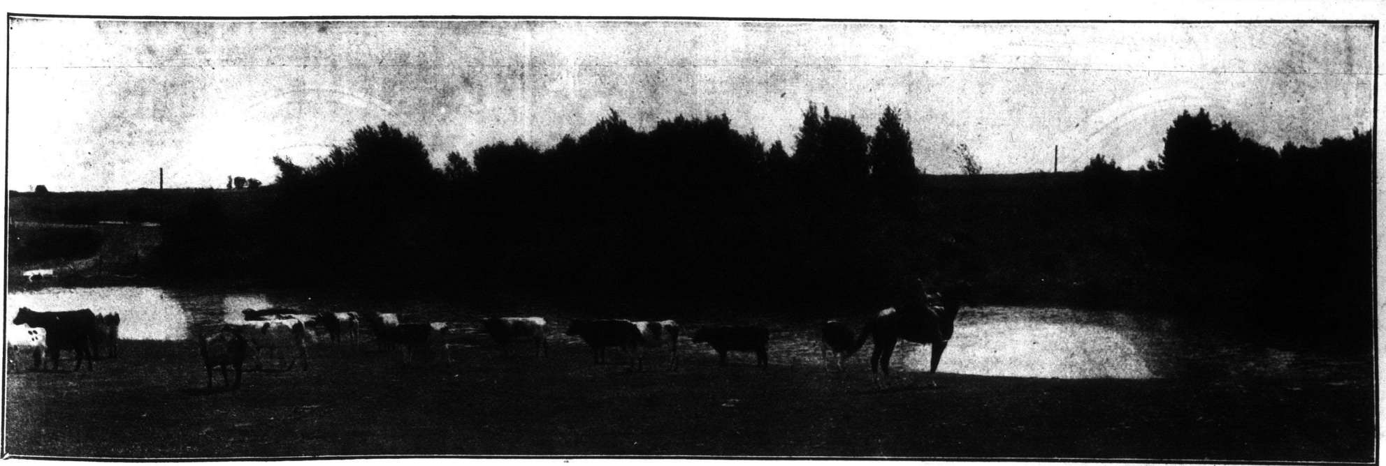
About to round up the herd and return home on a farm at Gladstone, Man.