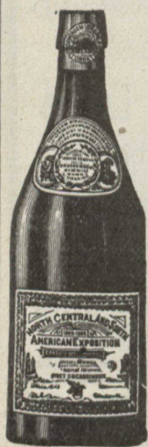
FAC-SIMILE OF WHITE LABEL ALE