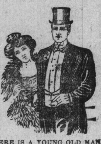
THAT GIVE THE SECRET OF 'PERPETUAL YOUTH

Years count for nothing if you have the vitality. You can feel young all your life where there is ample nerve force to back your courage. Let me make you a "HEALTH BELT MAN." Let me supply you with that vim, vigor and manly strength which conquers all obstacles. A man at 60 should be in the prime of life; early decline unfits you for the world's work. I have talked with more than 100,000 debilitated men; the lack of vital vigor is responsible for most failures; you can't command the attention and admiration of women or even men if you lack personal vitality. My HEALTH BELT fills you full of vital force; it strengthens weakened parts; it gives you courage to meet squarely any eyes which may look into yours. You become as attractive in your personal influence as the strongest, most fullblooded man you know. Thousands upon thousands