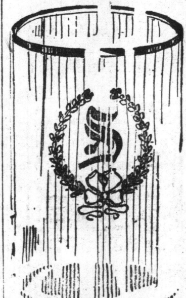
There Are Six Just Like This One in Each Set.

Rimmed and initialed within a filigree border in real silver—the thin-blown Tumbler Sets are taking the town by storm—every Exhibition visitor will want a set.