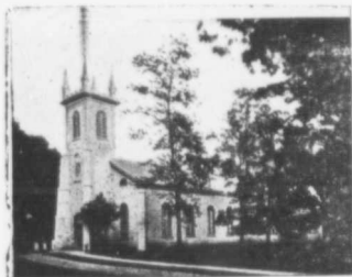
ST. MARK'S CHURCH

Especial mention must be made of Fort Niagara, across the river from the town. This is a regular American army post, and band usually stationed here during the summer season give band concerts in the Park on the river bank. This is one of the most pleasant fea-