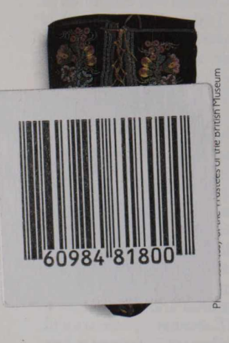
A beaded Dene baby's bag, probably collected in the Mackenzie Valley at the end of the nineteenth century.

The exhibition is designed to contrast life today for the Indian and Inuit peoples of the Canadian North with their life in the recent past. It focuses on their relationship to the land, from which they gain a living as hunters and trappers, and on the way in which their ancient way of life has been successfully adapted to meet the demands and opportunities presented by the development of Canadian society over the last four centuries. This will be the largest exhibition about the circumpolar north ever mounted in Europe.